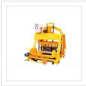
Egg Laying Concrete Block Machine