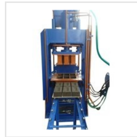
Manual Brick Making Machine