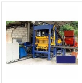
Fly Ash Brick Making Machine