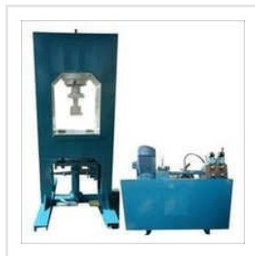
D Moulding Hydraulic Machine