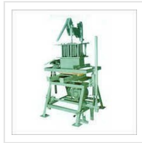
Hand Operated Concrete Block Making