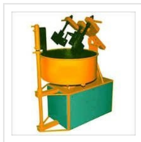
Color Mixing Machine