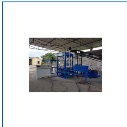
HOLLOW BLOCK MAKING MACHINE