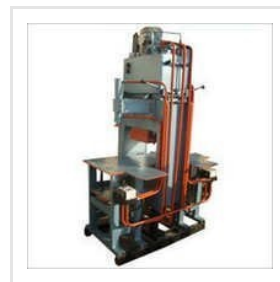
Paver Block Making Machine