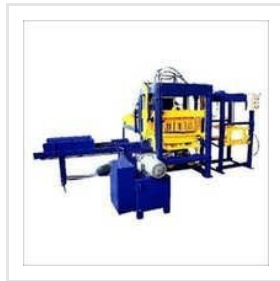
Semi Automatic Fly Ash Brick Making