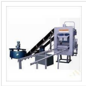
Interlocking Brick Making Machine