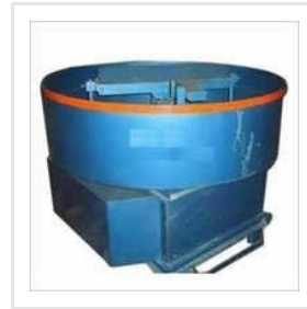
Roller Pan Mixer