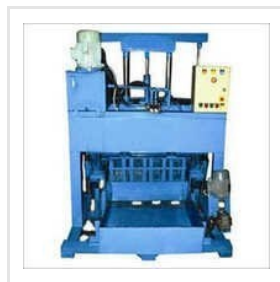
Concrete Block Making Machine