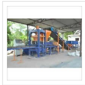
Fully Automatic Fly Ash Brick Making Machine