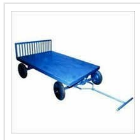
Pallet Truck Trolley