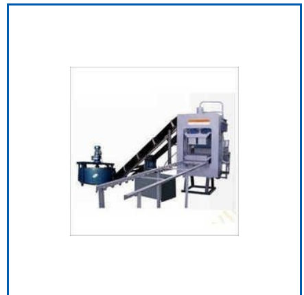
INTERLOCKING BRICK MAKING MACHINE